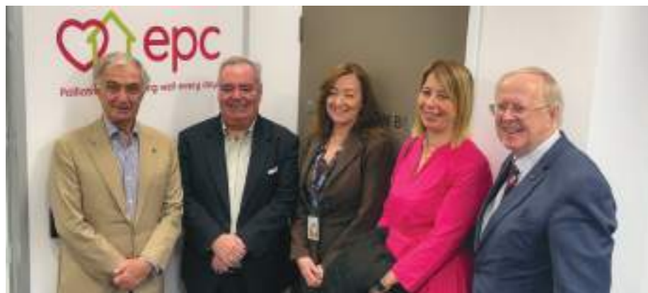
Far Left: A visit to EPC. The South Eastern Region continues to support Eastern Palliative Care (EPC) enabling end-of-life support that upholds dignity and compassion