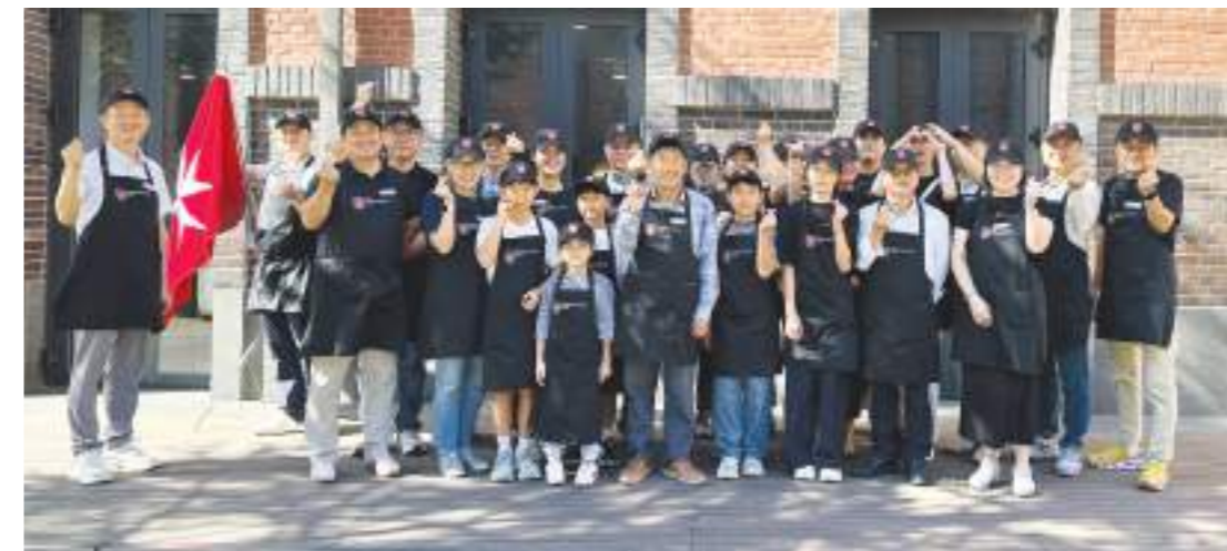
Left to right: Lourdes Pilgrimage with 12 OMK pilgrims including three junior volunteers pictured. OMK Monthly Mass on every second Sunday where family, friends and aspirants are also invited. OMK's pilot project to support migrant workers and refugees at Myungdong Cathedral. OMK's Pilgrimage and Spiritual Retreat trip to Gamgok Maegoe Virgin Mary Catholic Cathedral.