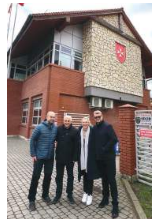
Left: Visiting works of the Order in Krakow.

Each conference also has a theme, some of them have been safeguarding, dementia and aged care, first aid and the spirituality of the Hospitaller works. Guest speakers come from all over the globe to share their expertise. We always have strong input and involvement from the Prelate who will speak about the more spiritual elements of our works and then we hear from other members such as the Grand Magistracy