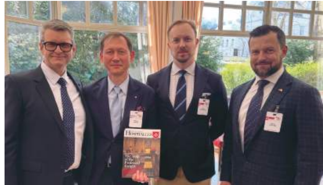
Opposite and Left: Travelling to different countries is educational in itself, to be able to learn about the culture, history and heritage of the land and how the Order plays a significant part in everywhere that we go.