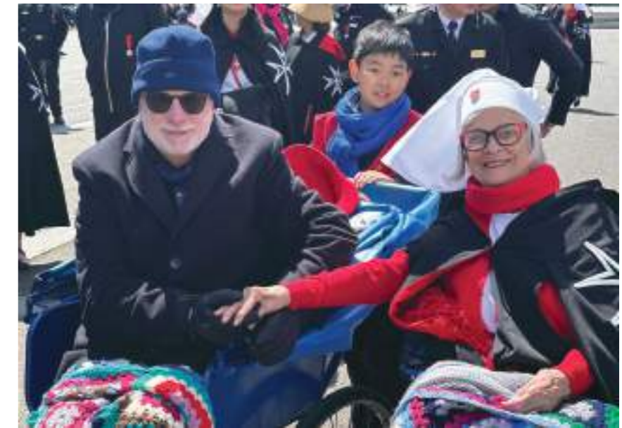
Above: Malades and members sharing a pilgrimage.

Sunday was our last full day at Lourdes with a Pontifical Mass at the Pius X Basilica, followed by a