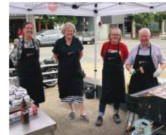
Left: The year 2024 has been full of quiet anticipation for the North Eastern Region of the Order of Malta, with ample projects providing food for those less fortunate.