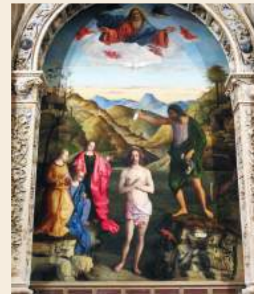
Above: Giovanni Bellini, Baptism of Christ 1504. Oil on wooden surface. The Church of San Giovanni Battista dei Cavalieri di Malta in Venice, after restoration. Grand Priory of Lombardy and Venice.