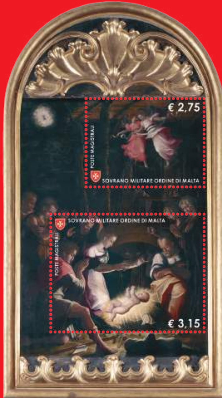
Giorgio Vasari, Natività , 1538, Chiesa Del Monastero Di Camaldoli (AR)