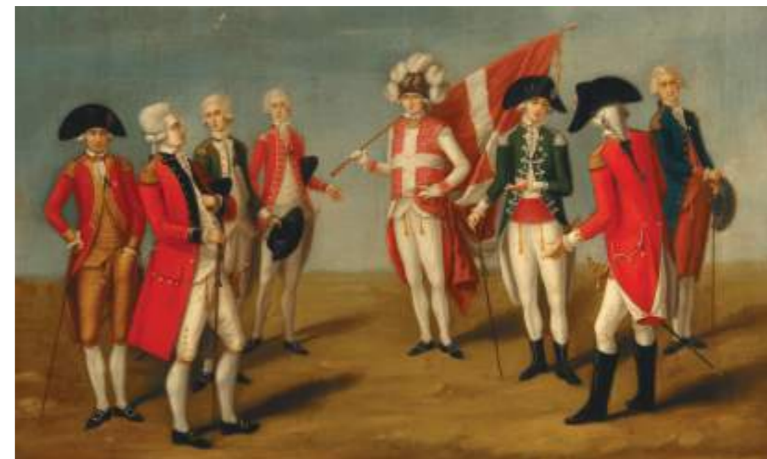
Above and below right: Typical Order of St John uniforms worn in the 18th Century.