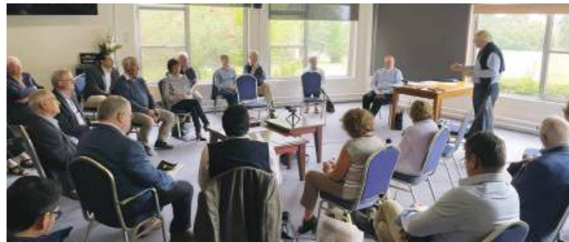
Left: Subpriory retreat.

My deep gratitude is extended to all of the Councillors and members of the Subpriory for their support and generous activities during this past year. 🙏