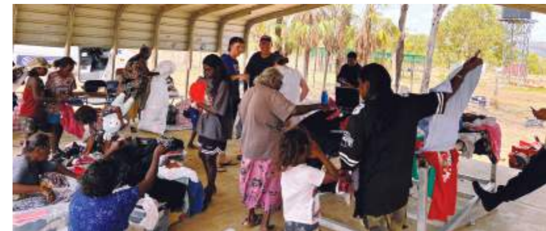
Left: More than providing material assistance, we reach out to understand the inner needs of those we serve.