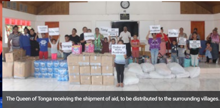
The Queen of Tonga receiving the shipment of aid, to be distributed to the surrounding villages.

The Order of Malta will continue to support our neighbours and friends in Tonga during their recovery effort.