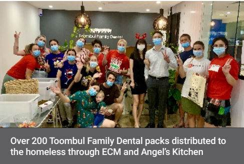
Over 200 Toombul Family Dental packs distributed to the homeless through ECM and Angel's Kitchen

DONATION TO COATS FOR THE HOMELESS AND CARE PACKS CAN BE MADE ON PAGE 5.