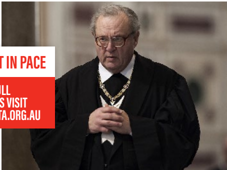
Fra' Matthew Festing died 12 November 2021

We honour his enormous contribution to Australian society and wish to convey our prayers and condolences to his family. He will be greatly missed.