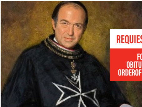
The Hon. Sir James Augustine Gobbo AC CVO QC died 7 November 2021