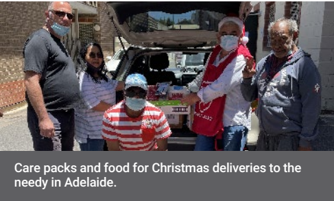
Care packs and food for Christmas deliveries to the needy in Adelaide.