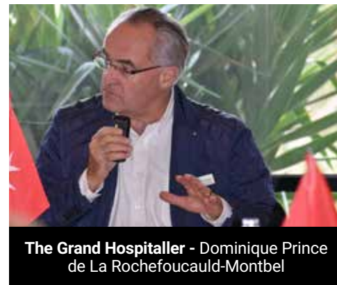
The Grand Hospitaller - Dominique Prince de La Rochefoucauld-Montbel