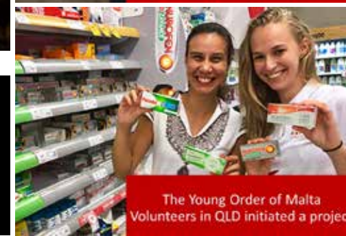
The Young Order of Malta Volunteers in QLD initiated a project

Visit www.orderofmalta.org.au to see a highlights video of our activities in 2018.