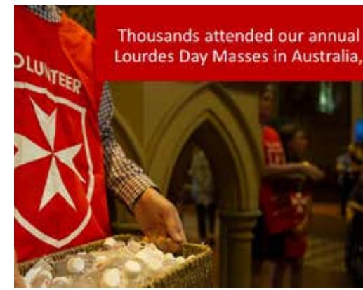
Thousands attended our annual Lourdes Day Masses in Australia.

2018 was quite a year for the Order of Malta Australia. Our national projects went from strength to strength and our regional projects and activities grew substantially.