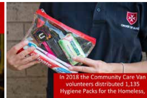
In 2018 the Community Care Van volunteers distributed 1,135 Hygiene Packs for the Homeless.