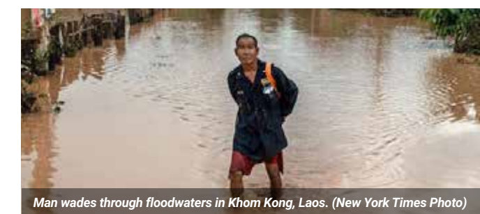
Man wades through floodwaters in Khom Kong, Laos.