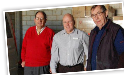
Coats delivered to Gorman House, Darlinghurst